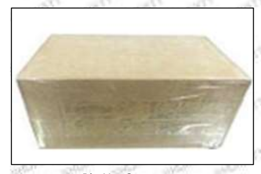
Pic No. 2 Domestic express packaging: Wrapped with Transparent tape

Minors are prohibited from using transparent tape, yellow tape, black wrapping protective film, and white wrapping protective film to avoid personal injury.